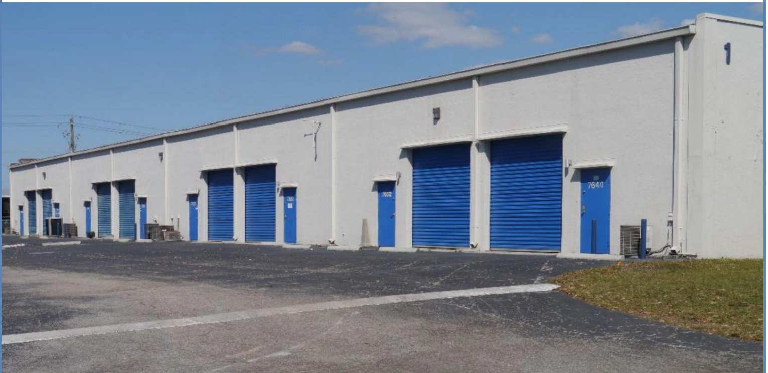
Buildings 1-4 Rear

For info: Jeff Button, Exclusive Agent | 941.313.1193 | jeff@sarasotawarehouses.com