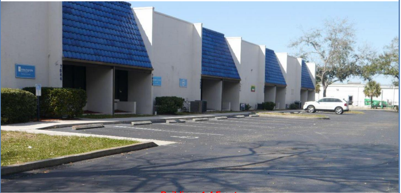
Buildings 1-4 Front