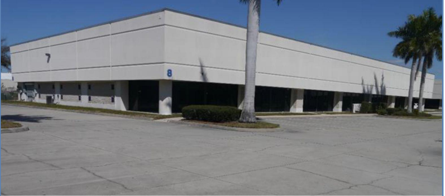
Buildings 5-8 Front