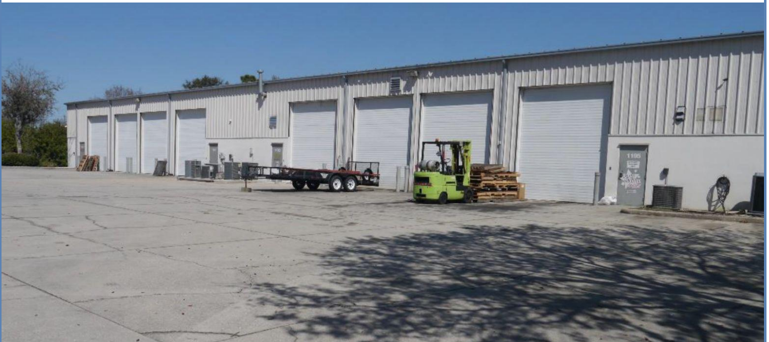
Buildings 5-8 Rear

For info: Jeff Button, Exclusive Agent | 941.313.1193 | jeff@sarasotawarehouses.com