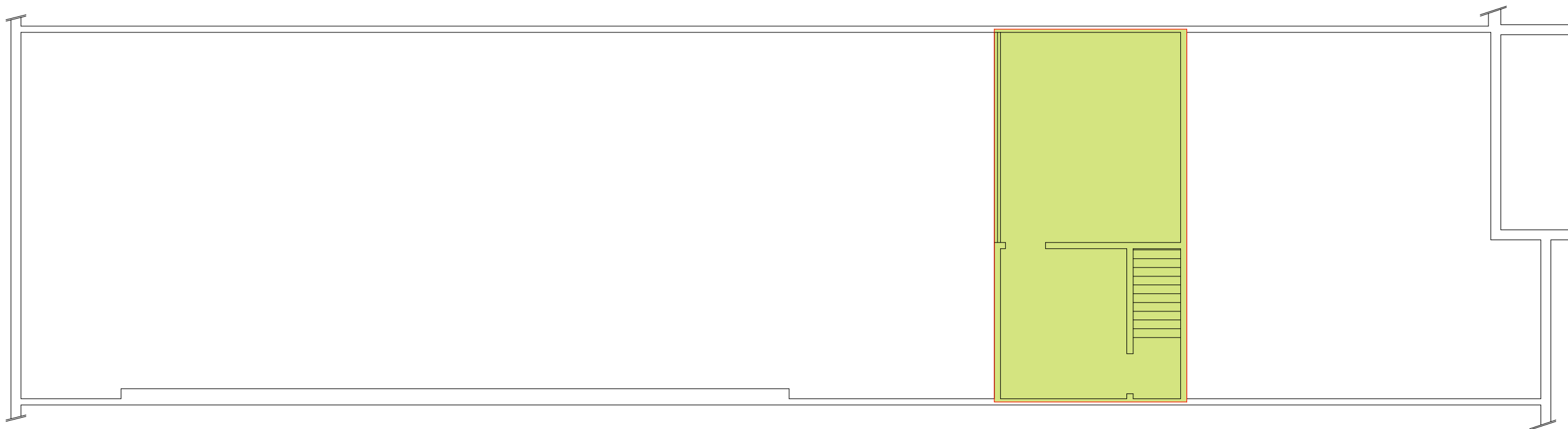
Mezzanine - 319 SF

Airport Commerce Center 7672 15th Street East Sarasota, FL 34243